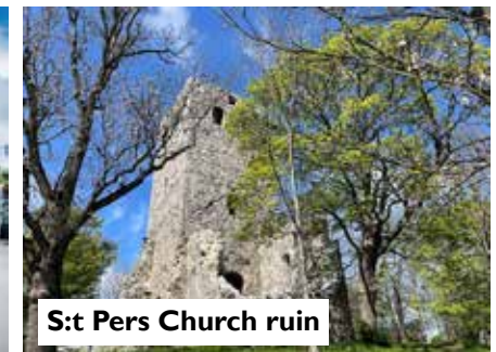
S:t Pers Church ruin